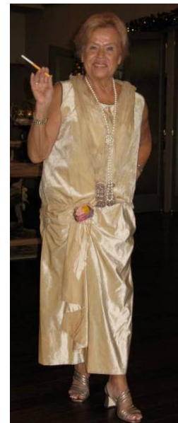
Hilton Head's Downton Abbey "fun"draiser.