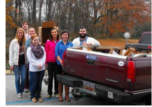
Due West packs Exam Goodie Bags for students

A personal touch is always welcome but we need to use all means to pass along our message.