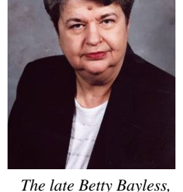
state Public Policy chair and AAUW national board member.

The Research and Projects Grant is a $75,000.00 endowment